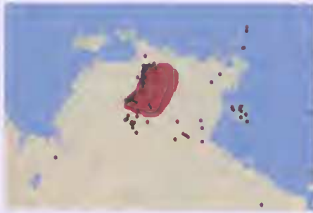
Fig. 3. Map of the Top End region of the Northern Territory showing approximate range of Macropus bernardus (red) based on Menkorst & Knight (2011) and locations (dots) of Gardenia fucata collections accessioned at the Northern Territory Herbarium (from I. Cowie). (Map drawn with ESRI ArcGIS)

& Symon 1988; Martine & Anderson 2007; Martine & Capaldi 2013), have noted that, although long-distance pollinators are rare visitors to flowers on outcrops, most of the services are provided by small-bodied bees flying over short distances.